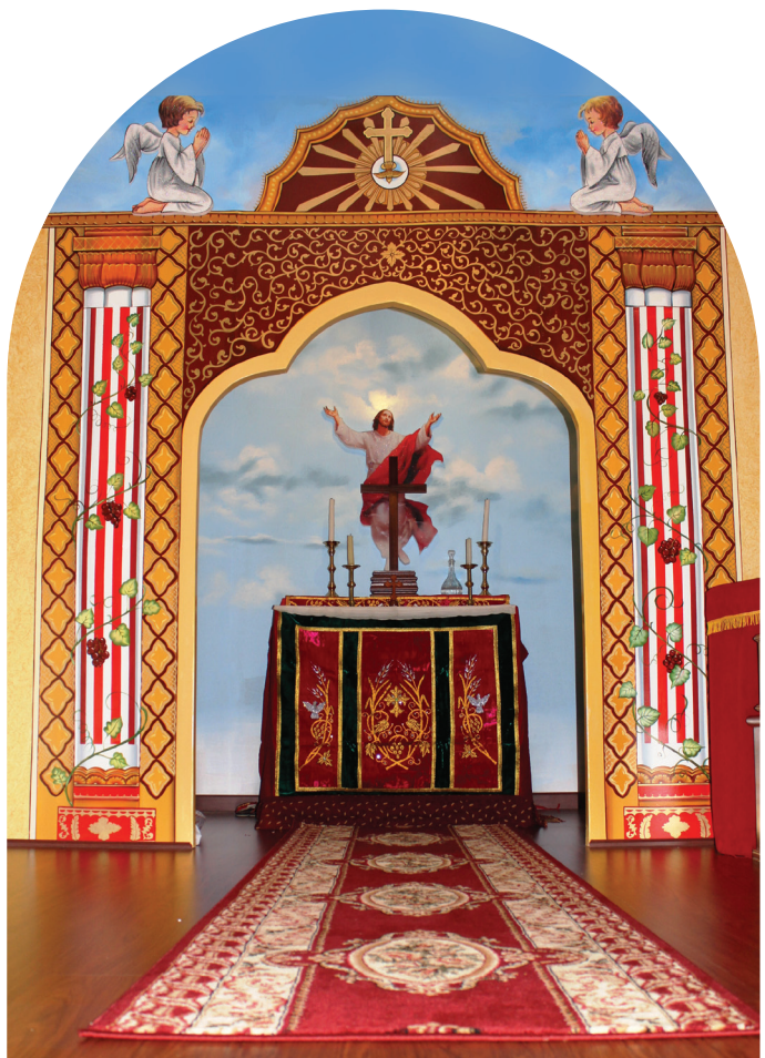
Renovated 'Madbaha' at St. George Chapel (Parsonage Chapel - Abbassiya)